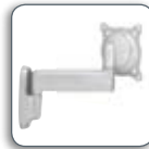
FWS Single Arm Wall Mount