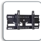
RMT 26 - 40" Tilt Rail Mount