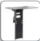
FUSION VIDEO CONFERENCING SHELF