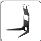
FUSION COMPONENT SHELF

For a complete list of flat panel mount accessories see page 73.