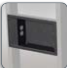
PAC521P ■ In-Wall Box with Power Outlet Conditioner