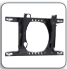
MTRV 26 - 40" Tilt Wall Mount