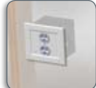
PX2W ■ Power Outlet Conditioner