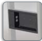
PAC521P ■ In-Wall Box with Power Outlet Conditioner