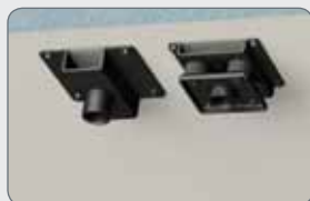
concrete CMA330 & CMA345