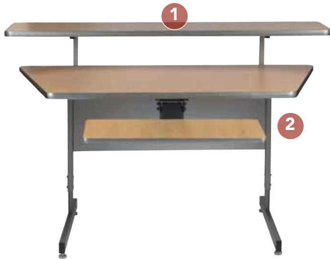
Shown with optional RB-46 and KBS-2.