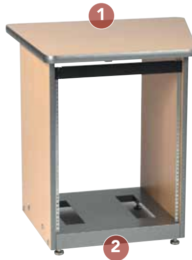
Shown with silver steel side material.