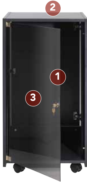
Shown with optional Plexi front door and optional wooden rear door.