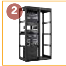
Casters, Floor Levelers, Front and Rear Doors, and Side Panels ordered separately.