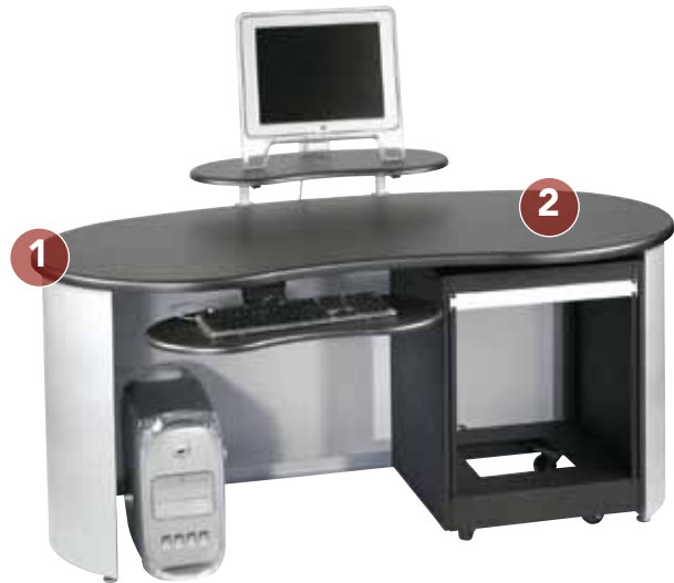
Shown with optional monitor shelf and optional rack.

Graphite Laminate with silver steel frame ■ ■