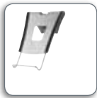
KRA300 □ Laptop Tray