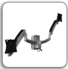
K1S200 Dual Arm Slat Wall Mount