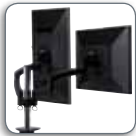
K2C200 Swivel Column Mount, Dual Monitor