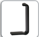
KSA1012 ■ Extended Reach Desk Clamp Bracket