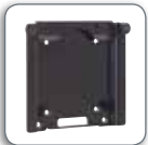
KSA1007 ■ Centris Quick-Connect Interface