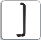
KSA1008 ■ Extended Desk Clamp Bracket – Compatible with 2.5" - 5" (64-127 mm) thick surfaces