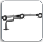
KCD320 Triple Monitor Swing Arm Desk Mount