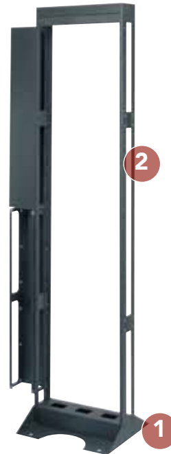
Optional RCM cable manager shown.