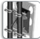
TPP TV Tilt Truss Mount