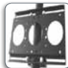
TPK1/TPK2 Pole Kits (TPK 2 shown)