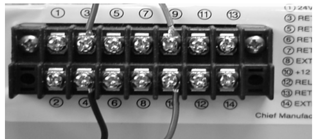
Figure 5. Brown Wire to Terminal #10