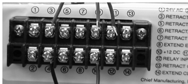
Figure 6. Red Wire to Terminal #11