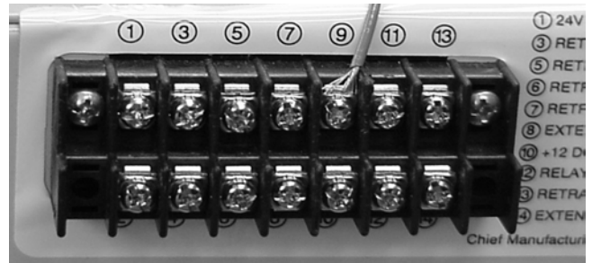
Figure 2. Green Wire to Terminal #9