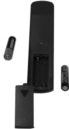
Figure 7. Install Batteries