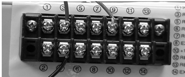
Figure 4. Violet Wire to Terminal #4