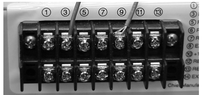
Figure 3. Black Wire to Terminal #3