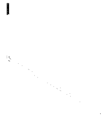
Fig. # 2