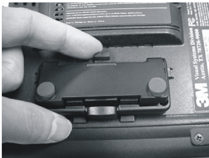
Figure 1: Finger Tab