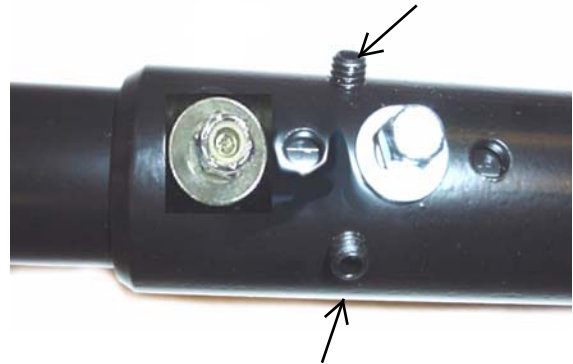
Figure 2. Secure Columns Using Set Screws