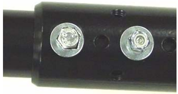
Figure 1. Bolt Column Tube to Ceiling Plate Tub